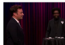
Derren Brown Plays Magica Who?' with Fa