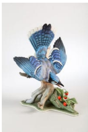
Work by Boehm Porcelain at the State Museum as part of 'Fine Feathered Friends.'

New Jersey State Museum , 205 West State Street, Trenton. 609-292-5420. www.statemuseumnj.gov . Free admission.