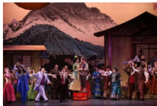
New York Gilbert & Sullivan Players and Orchestra’s new production of ‘The Mikado.’

New York Gilbert & Sullivan Players and Orchestra’s new production of “The Mikado” mixes the real-life characters of Victorian London’s D’Oyly Carte Opera Company with the imagined setting of the operetta’s Japanese inspired city. Saturday, January 25.