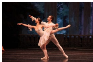
The Russian National Ballet's 'Sleeping Beauty.'

Dance at the State Theater , 15 Livingston Avenue, New Brunswick. 732-246-7469. www.statetheatrenj.org .