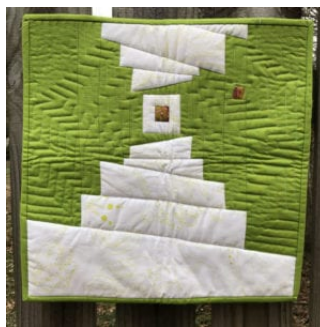
Work from 'If These Quilts Could Talk.'