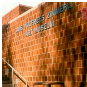
Up Close and Personal: French Prints Capture