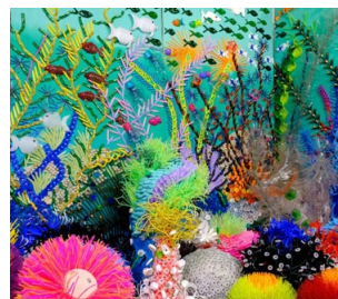
Reef Installation, 2019, Plastic and mixed