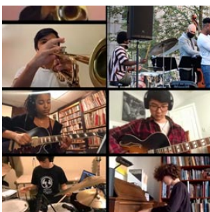
And All That Jazz House Kids