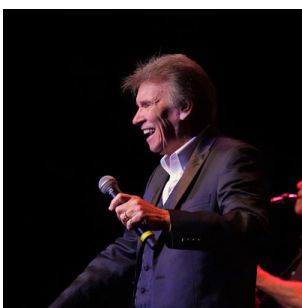
"Bring Back That Sunny Day!" Spotlight on Tom Garrett of The Classics IV