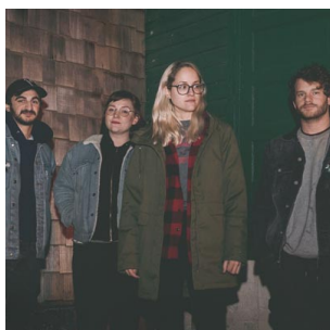
Makin Waves with Well Wisher: Indie Intimacy