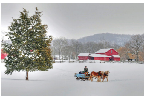
Howell Farm's Christmas on the Farm.

Heading this year's list is a regional holiday tradition that never goes out of fashion.