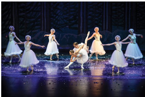
Roxey Ballet offers a made-for-TV Nutcracker.

The Roxey Ballet, a professional dance company in Lambertville, presents its annual version of “The Nutcracker” in a made-for-television film available for viewing through the company’s “Nutcracker Channel” through January 1.