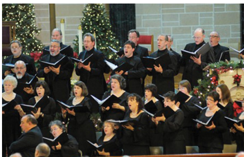
The Capital Singers of Trenton.

A digital program book will be available in advance to enhance the audience experience. For broadcast access: 609-497-0020 or www.princetonsymphony.org .