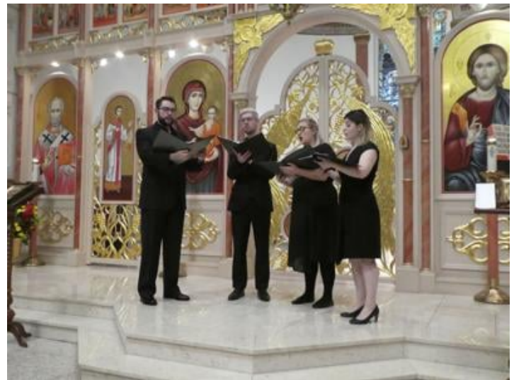
The Theoria a capella group performs at Assumption of the Virgin Mary Byzantine Catholic Church in Trenton on December 18.