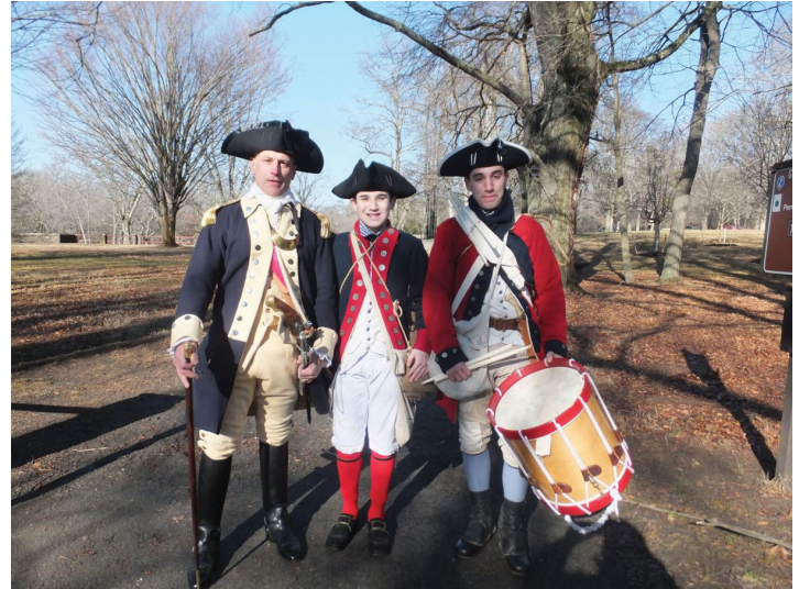
There are two chances to witness the reenactment of Washington crossing the Delaware: the December 12 dress rehearsal and the Christmas Day crossing.

Then there is the free Christmas Day crossing. The main event is at 1 p.m., but visitors can arrive early and march with the troops, tour buildings, and join fellow festival lovers waiting for the cannon shot to signal the launching of the boats. An early arrival also helps to secure a parking place or a good viewing spot.