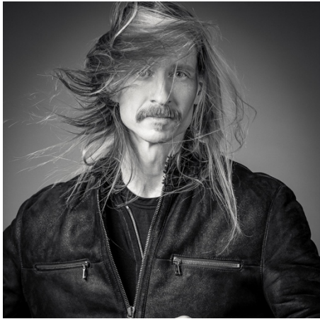
American Repertory Ballet Ethan Stiefel, Artistic Director

Led by Artistic Director Ethan Stiefel, and with a distinctive reputation for innovation and individuality, American Repertory Ballet (ARB) is recognized as one of the state's premier performing arts organizations. Presenting classical repertory alongside new and existing contemporary work, ARB is a founding resident company of the New Brunswick Performing Arts Center while also performing in major venues across New Jersey and beyond for an annual audience of more than 30,000. Founded in 1954 as the Princeton Ballet Society, ARB has been consistently designated a "Major Arts Institution" by the New Jersey State Council on the Arts for the past two decades and has repeatedly been awarded a Citation of Excellence by the Council. The company has been recognized by the National Endowment for the Arts and other major foundations and leaders in the field as a prominent force in the field of dance. Princeton Ballet School, ARB's official school, attracts talent from around the world while providing opportunities for local students of all ages, such as through its award-winning DANCE POWER program. Find American Repertory Ballet online at arballet.org .